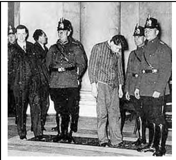
Photographs of Van der Lubbe with a box of matches, taken by police when he was in custody