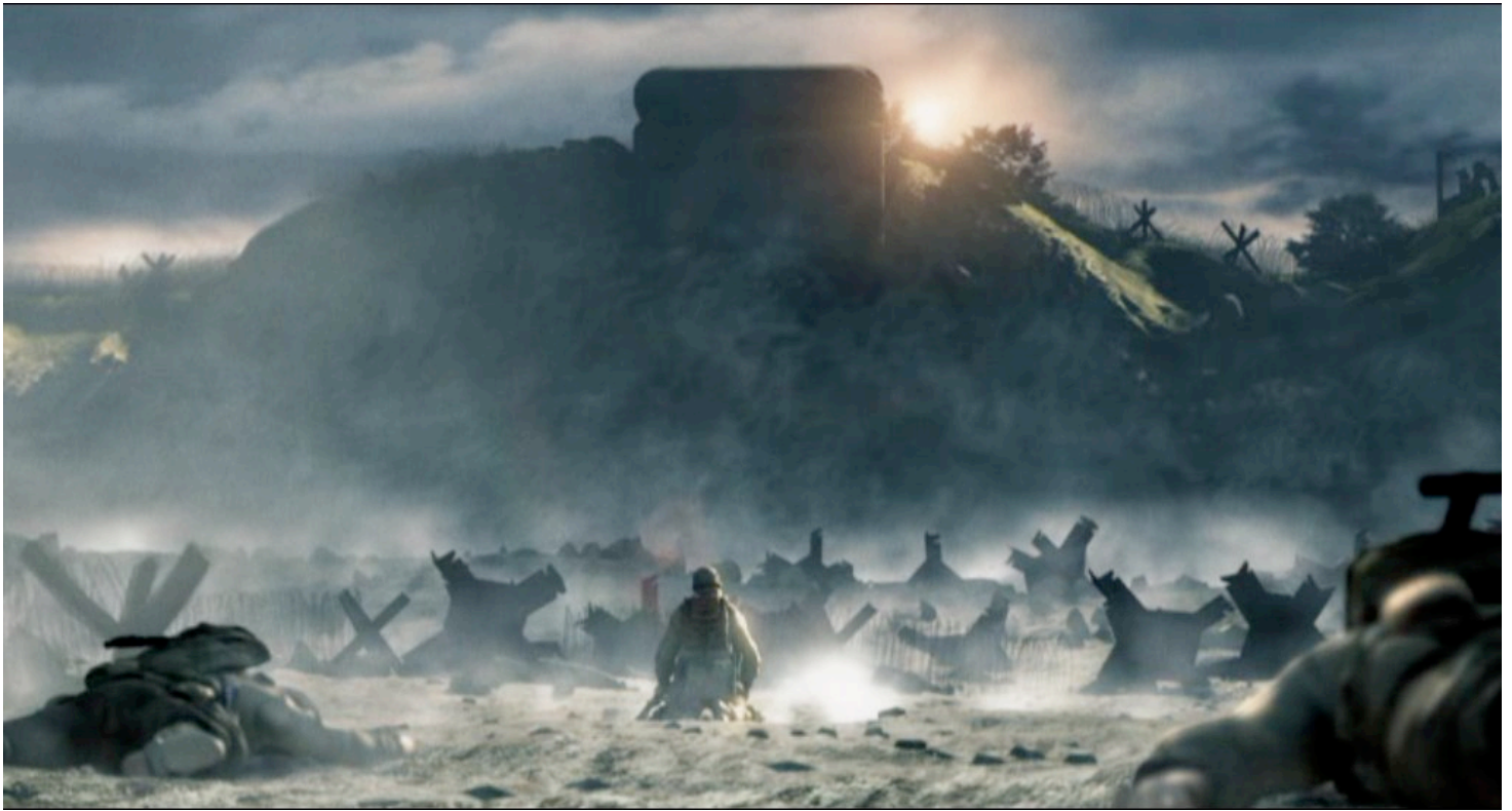
Source 1 - A soldier at Omaha

In Source 1 we see scenes of the first wave of the men that disembarked onto the Omaha beach. This scene ends with the last man falling on his knees before his body is ripped with the bullets of an MG42 in a bunker.