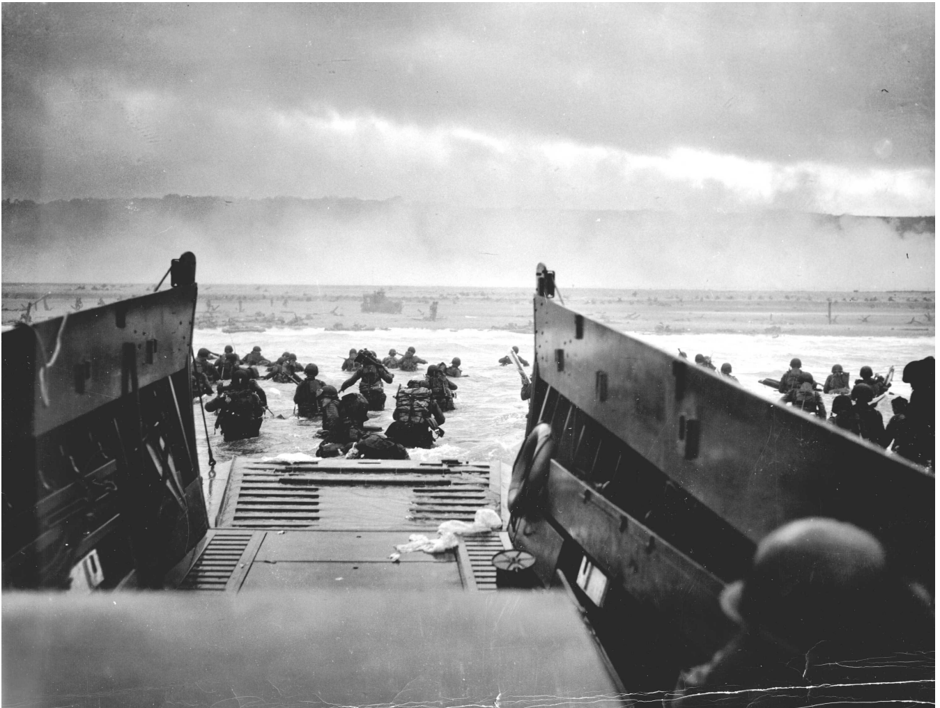
US troops landing at Omaha

http://www.history.army.mil/images/Reference/normandy/pics/CG-2343.jpg