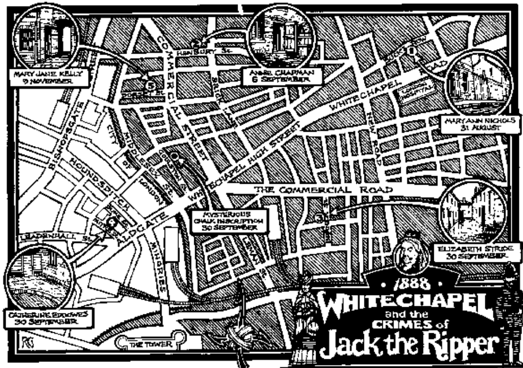
SOURCE C: A map of the East End in 1888 showing the sites of the murders

The body has not been dissected, but the injuries have been made by someone who had a lot of medical skill and knowledge. There are no meaningless cuts...No unskilled person could have known where to find the organs. No slaughterer of animals could have carried out these operations.