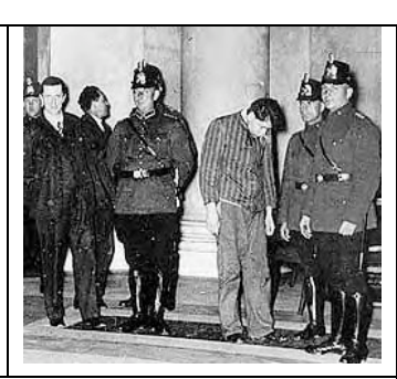
Photographs of Van der Lubbe with a box of matches, taken by police when he was in custody